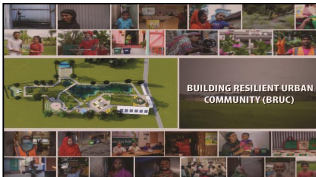
Faridpur Community Led Project