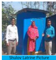
Shulov Latrine Picture