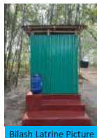
Bilash Latrine Picture