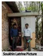
Soukhin Latrine Picture