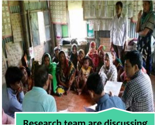
Research team are discussing with learners' mother for their children education