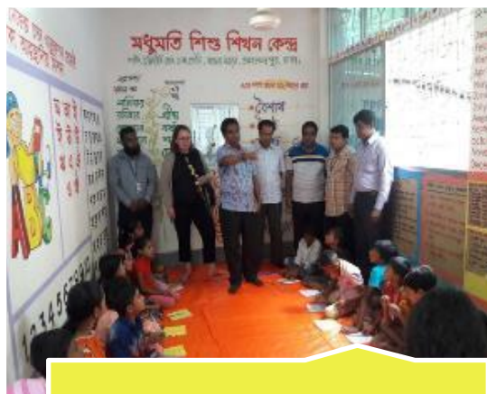
Inauguration of SCE project CLC by the COP of SCE, SCiB