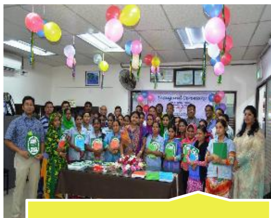
Workplace based Adult Literacy Program