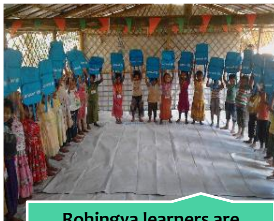
Rohingya learners are attending learning centers at Balukhali Refugee Camp