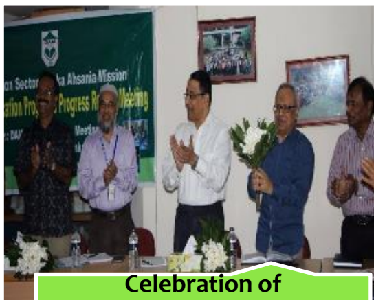
Celebration of commonwealth education good practice awards 2018 for UNIQUE II project