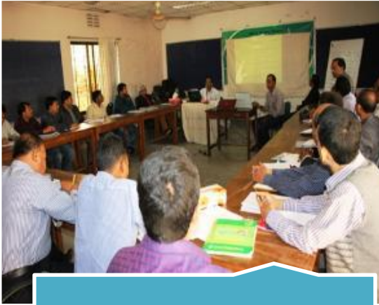
Workshop on Sustainability of DAM-CLC project