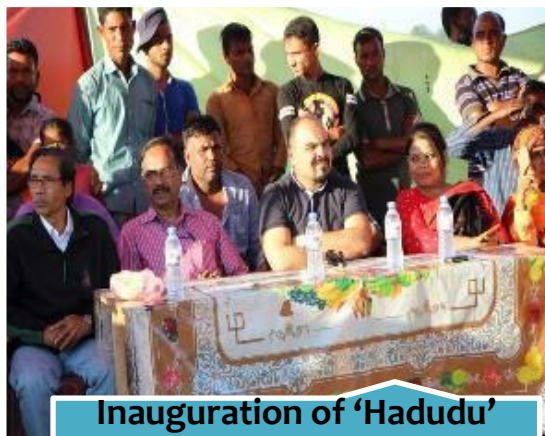
Inauguration of 'Hadudu' sport by the donor of JOYFUL project during field visit