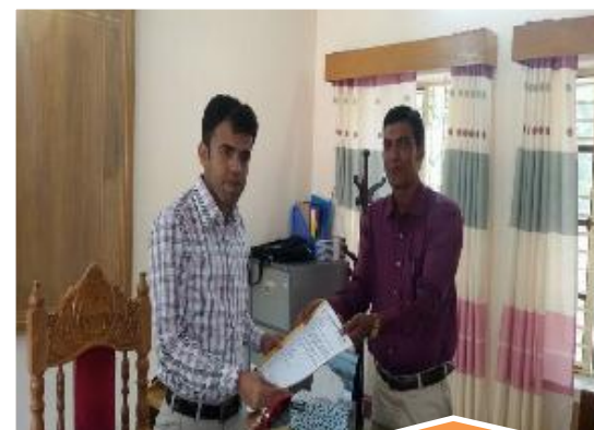
CLC hand over to the Upazila Nirbahi Officer – a part of phase forward plan of project