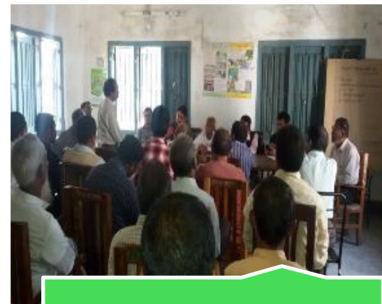
UP Standing Committee Meeting