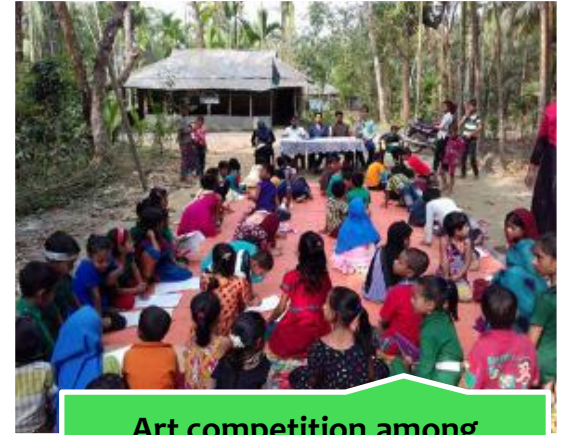
Art competition among learners on International Mother Language Day