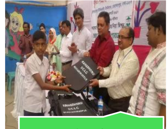
Reception of scholar learners by local leaders