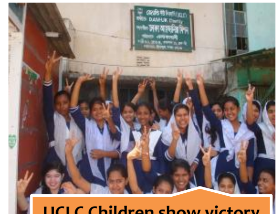
UCLC Children show victory after getting good result in JSC examination