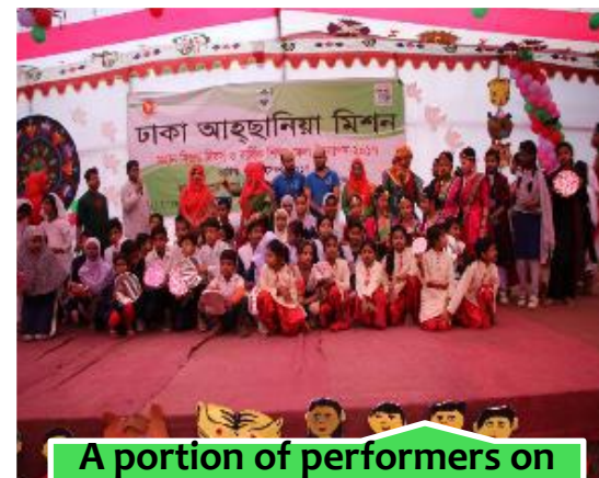
A portion of performers on the occasion of victory day fair and annual cultural program