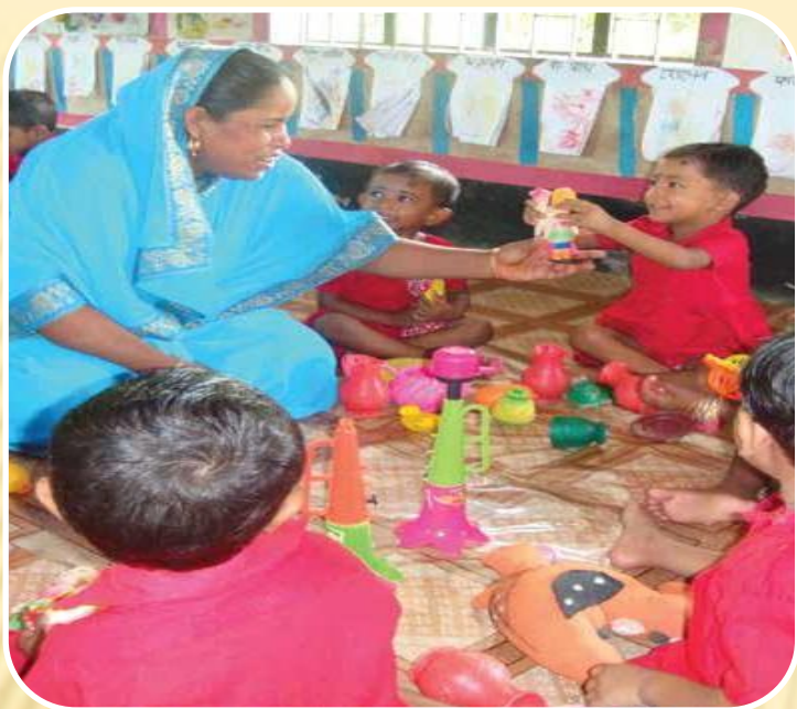
Early Childhood Development