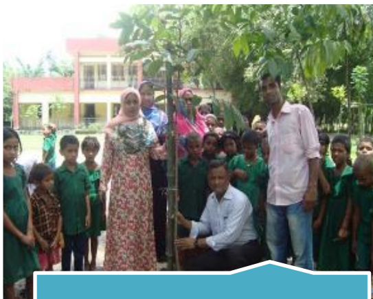
Total 52040 tree plantation