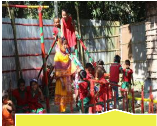
Children Park in front of SBK