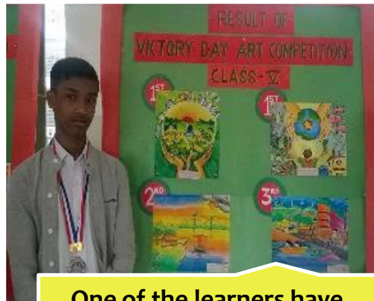
One of the learners have achieved 2 nd prize in victory day art competition