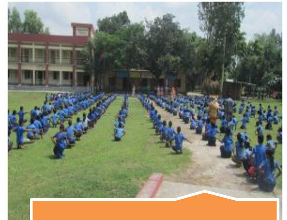
100% school dress