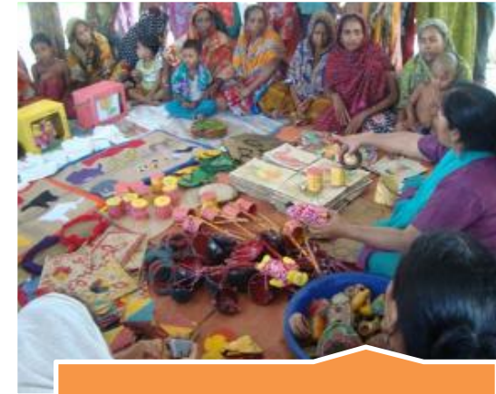
Indigenous materials made by community