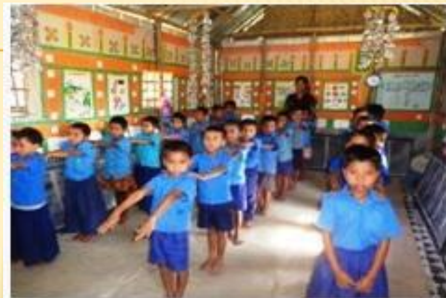
Pre- Primary Education