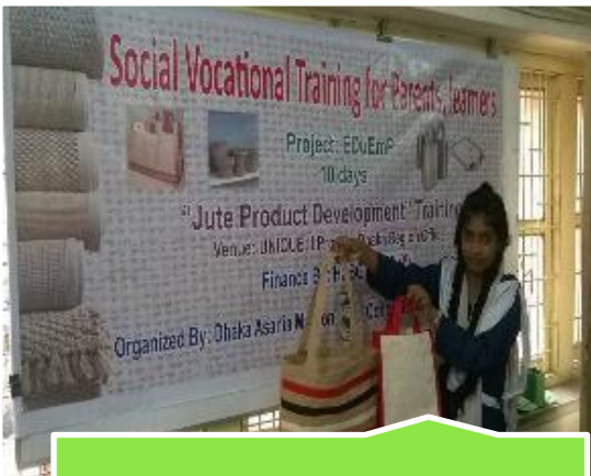
Process of Life-skill and Livelihood Development