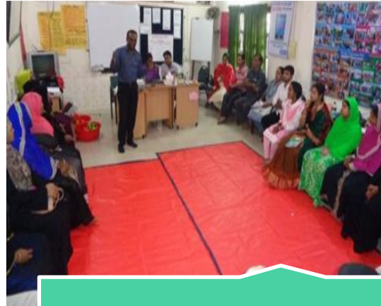
SBK resource pool