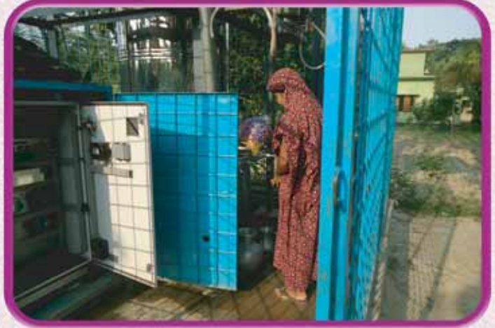
Arsenic and saline removal Sujol plant