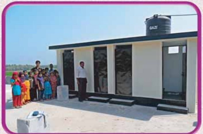
Disaster Friendly Latrine