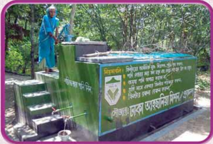
Filtering pond water using sand