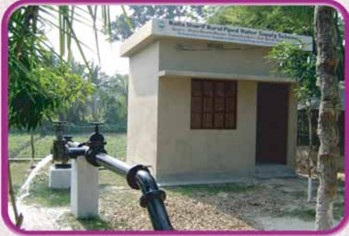
Rural piped water supply scheme