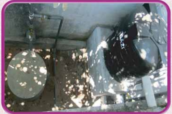
Rainwater harvesting and ground water recharge