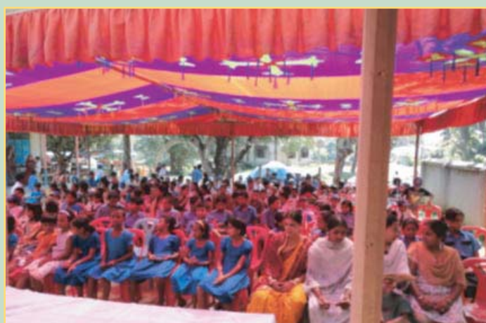
Children undergoing self-learning training