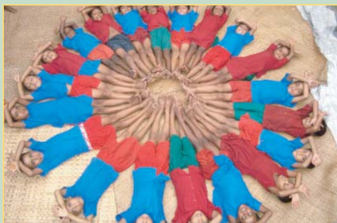
Child development activities