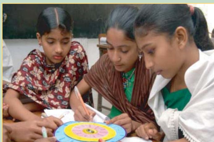
Children's improved schooling system underway