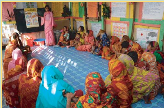
Parenting support for mothers