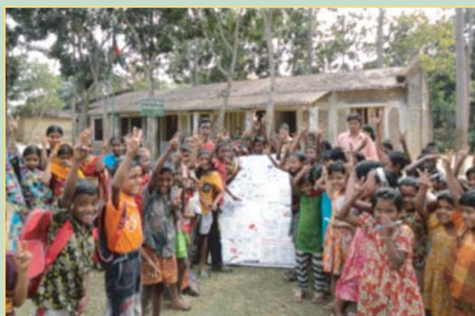
Children in joyful learning