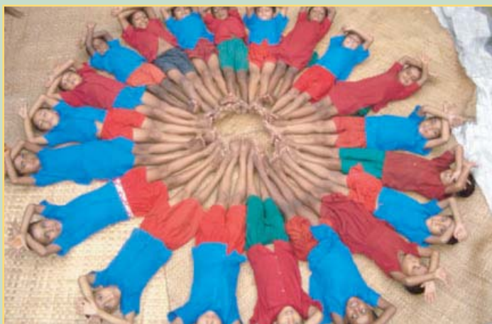
Child development activities