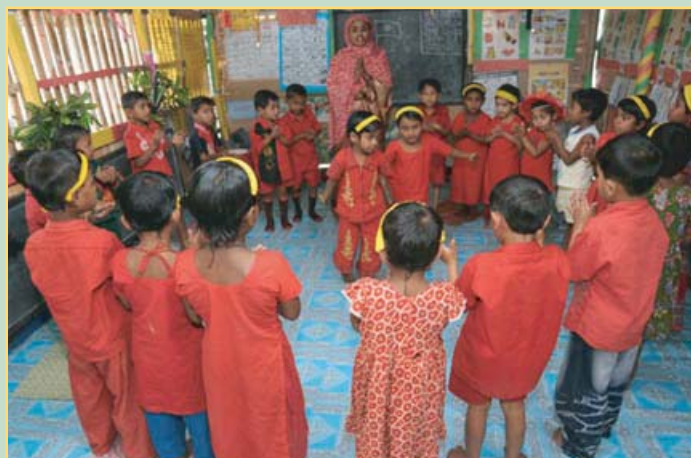
Children doing pre-school activities