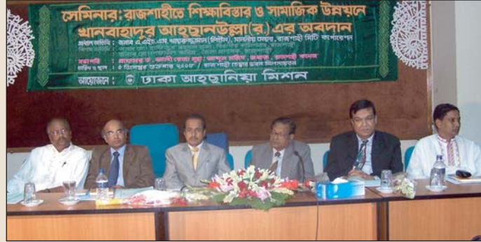
Speakers at the birth anniversary seminar in Rajshahi