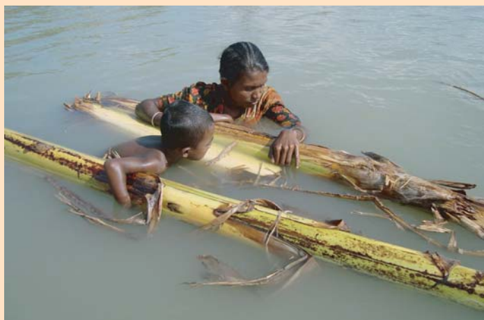
A community volunteer in a mock show