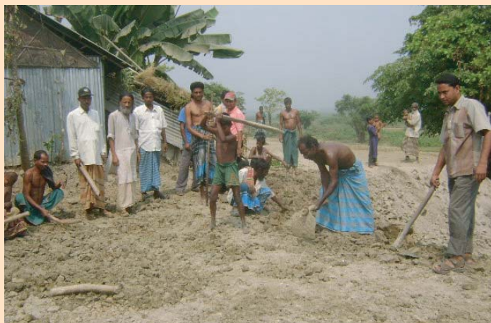
Homestead raising activities underway at Dharmapasha