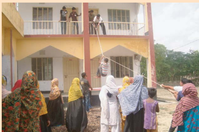
Another drill underway