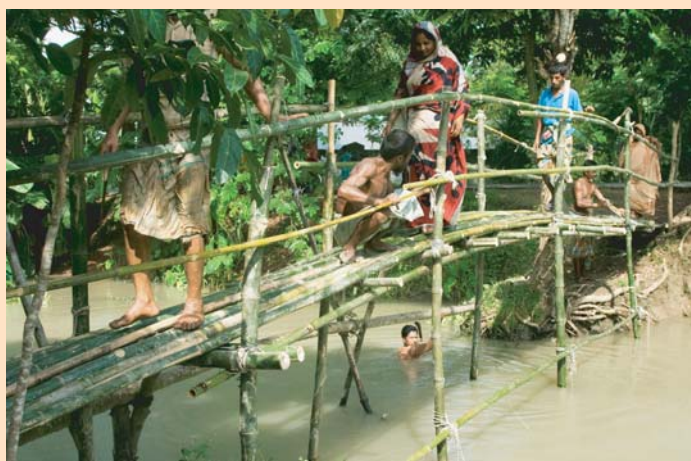
volunteers making a make-shift bridge