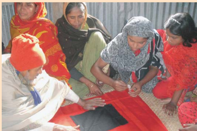
Radio spot managers engaged in preparing early warning signals