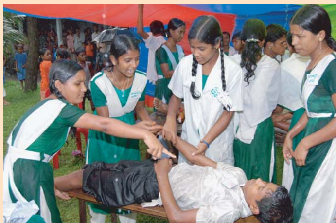
Students at a drill