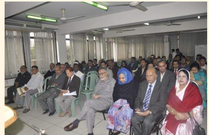
DAM Conference Room (4th floor)