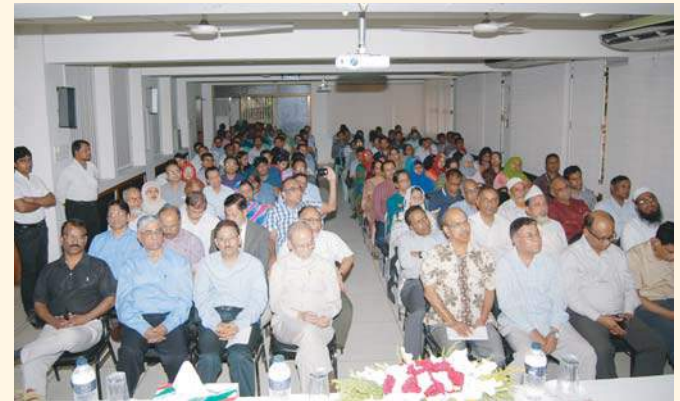
DAM Auditorium (1st floor)