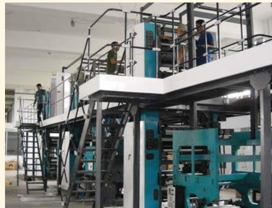
Ahsania Press and Publication

Manager/Coordinator Ahsania Press and Publication Tel: 8119522, 9123420, Ext. 118 Cell Phone: 01552383626 Email: ahsaniapress@gmail.com; app@ahsaniamission.org.bd